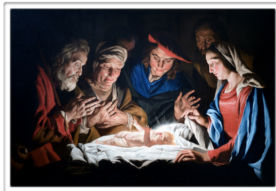
Adoration of the Shepherds by the Dutch painter Matthias Stomer, 1632

Artists like Leonardo Da Vinci, Caravaggio, Rembrandt, and Stomer were known for their use of such stark contrasts between light and dark in their paintings, which is an art technique called chiaroscuro (Italian word for “light and dark”). This method of modelling gives more form to the objects and characters in the painting almost giving them a three dimensional appearance. At the same time these kinds of paintings can draw our attention to the source of light in the painting be it from a candle, through a window, or coming from another source. In Stomer’s painting above it is clear that the source of light is the Christ child, whose radiance reveals the faces of Mary, Joseph, and the shepherds.